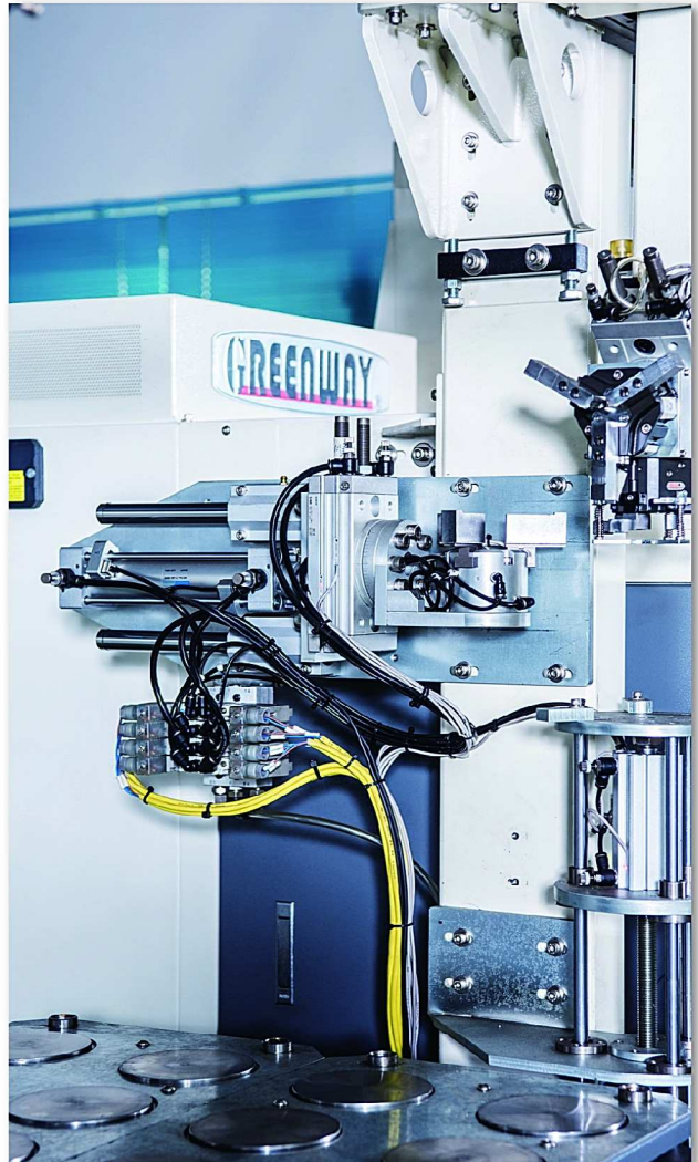
▲ 翻轉台(選配) Rotary station(opt)