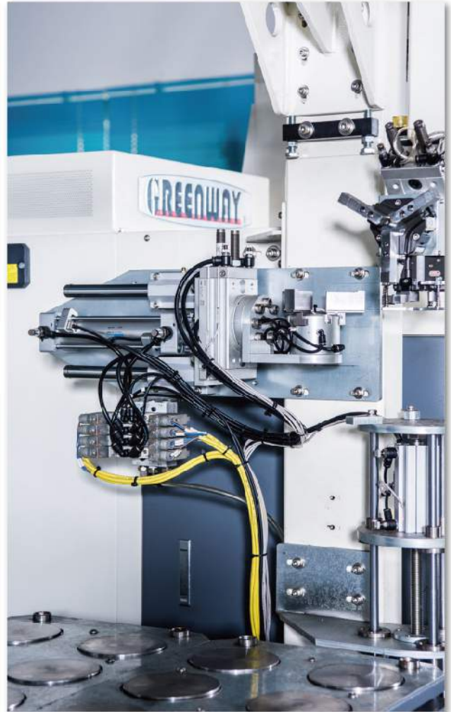
▲ 翻轉台(選配) Rotary station(opt)