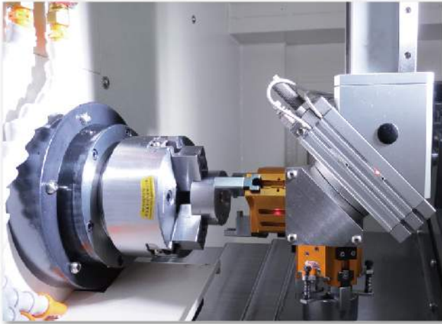
▲ 迴轉氣缸含三指定心機械夾爪 Pneumatic rotary air-cylinder with 3-jaw concentric gripper