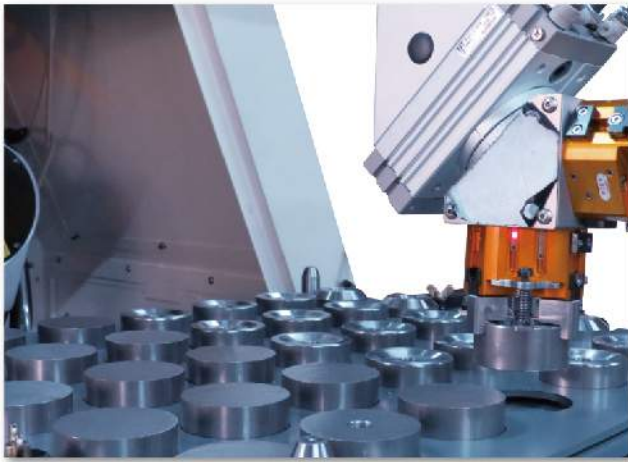
▲ 平板式供料台 Pallet type work feeder station